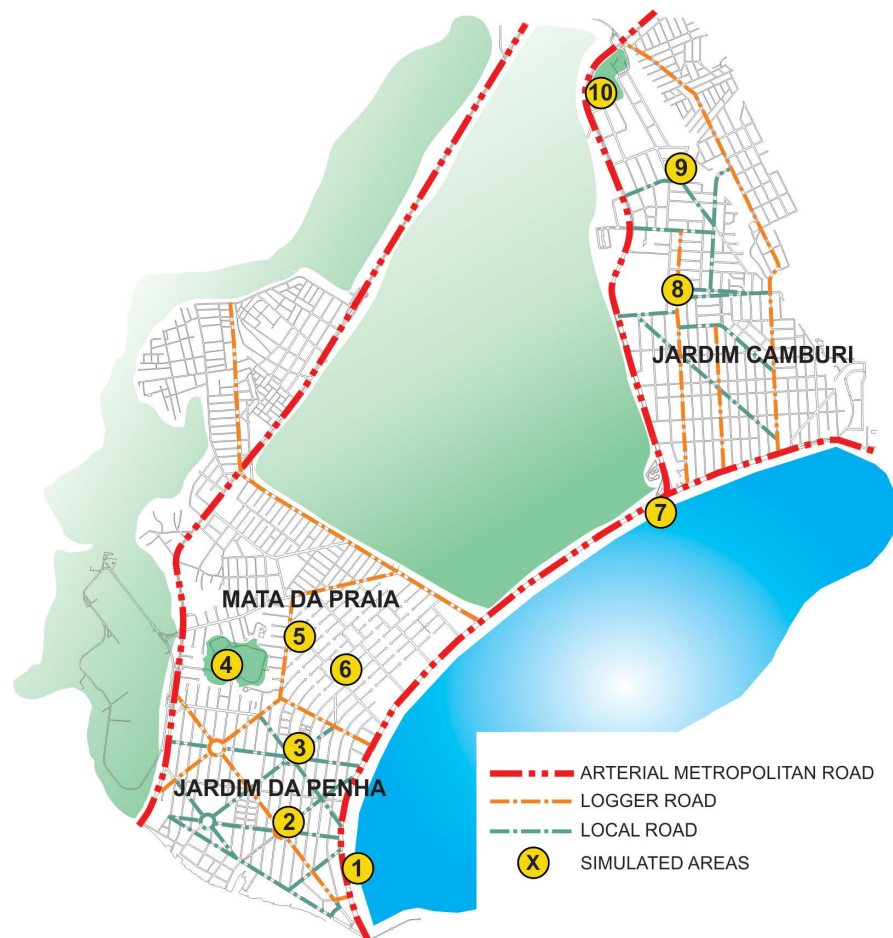
Figure 1. Map of an urban part of the city of Vitória, showing the location of the points selected for the measurements [9].

then prepared and a pilot experiment was carried out to test this form of addressing the population, as well as the number and relevance of the questions and the time spent in conducting the interviews. Having defined the questions, the interviews were conducted.